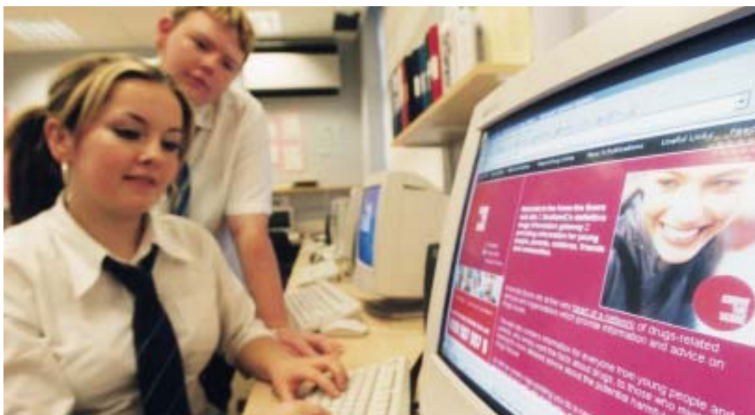
The Know the Score website – an integral part of the National Drugs Communications Strategy