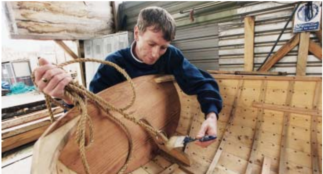
A recovering drug misuser uses his skills at the Gal Gael Project, Govan (funded by Scottish Communities Against Drugs)