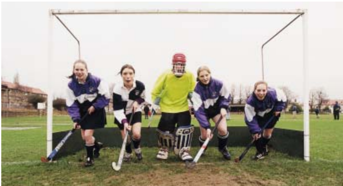
Sport is a good example of how youngsters channel their energies in a positive and enjoyable way

(the overarching aim is that, by this year, all schools will be able to report that they provide drug education in line with national advice, and all schools will have procedures in place)