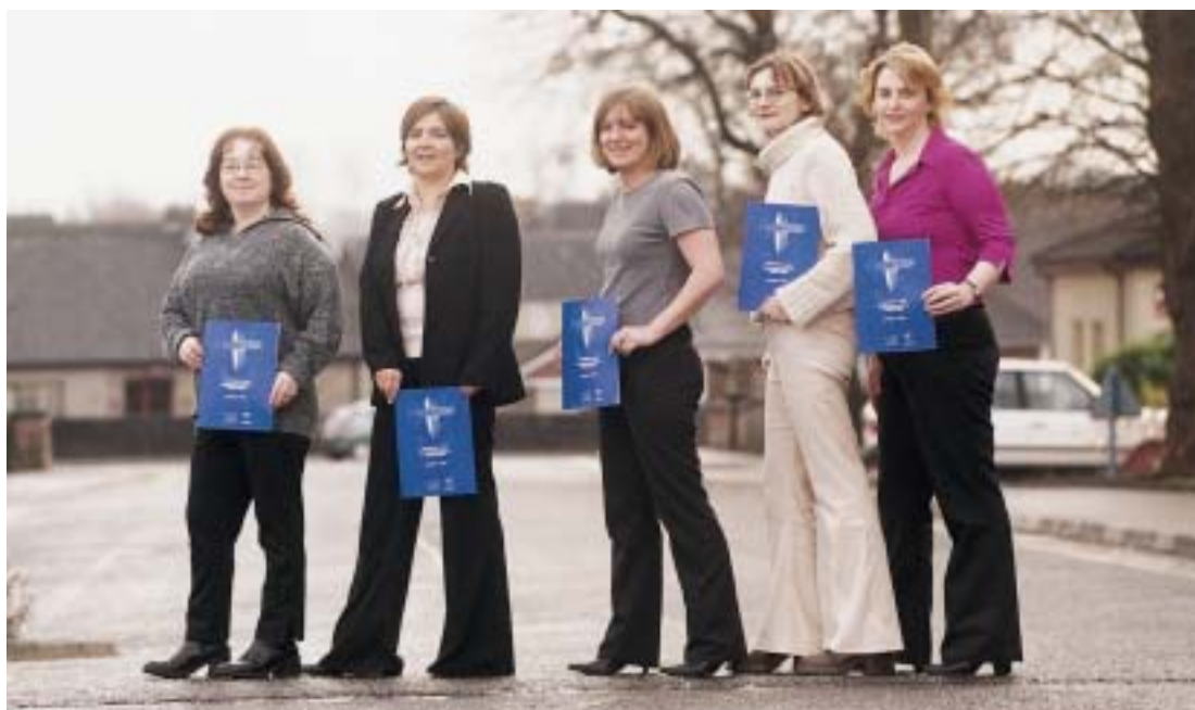
Staff from Signpost Forth Valley, a groundbreaking community project for drug misusers and their families