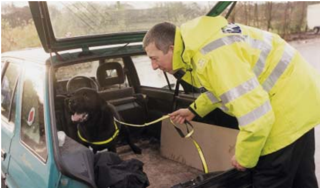
Police use many methods to target drug dealers, including the traditional 'sniffer' dog