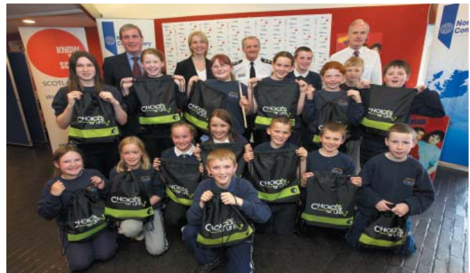
Conon Bridge Primary School pupils and staff enjoy the “Choices for Life” event in June 2005.

The first ever national roll-out of “Choices for Life” was launched on the 30th May 2005 at Eden Court Theatre, Inverness. The show, aimed at primary 7 children, played to capacity houses. There followed 12 days in which the event played to audiences in Glasgow (four one day events), Western Isles, Shetland, Orkney, and Aberdeen ending in Edinburgh on the 10th June. In total 2770 pupils across the Highland and Islands areas were reached and some 60,000 across Scotland. Letters received from both teachers and pupils indicated that the show’s message, style and format was just right for the target audience. This response has been echoed across Scotland and formal evaluation of the event is awaited.